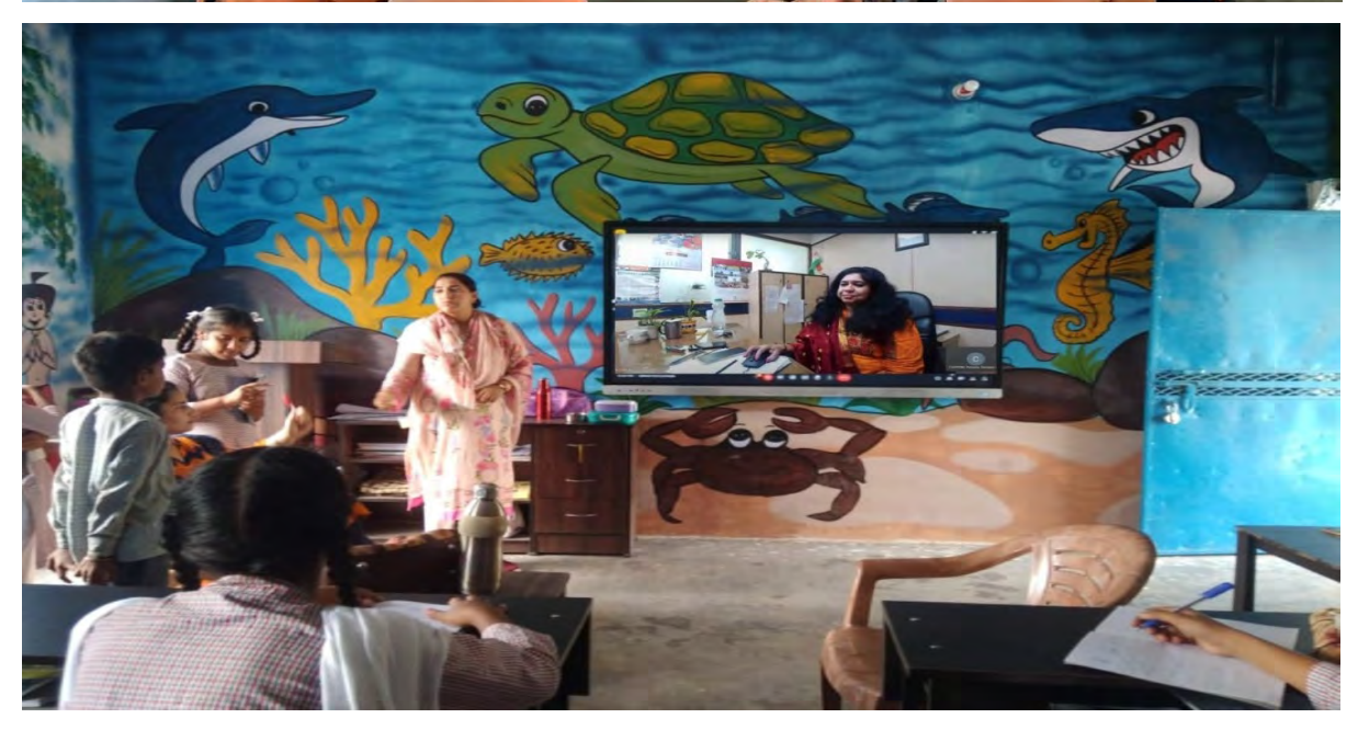
Report of "Rashtriya Boudhik Sampada Mahotsav" – 9th August 2023