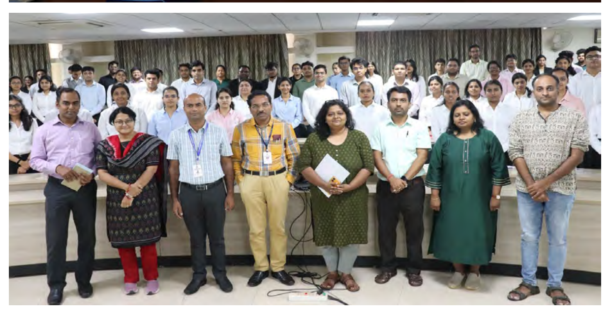
Report of "Rashtriya Boudhik Sampada Mahotsav" – 9th August 2023