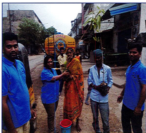
Fig. 8 (c)