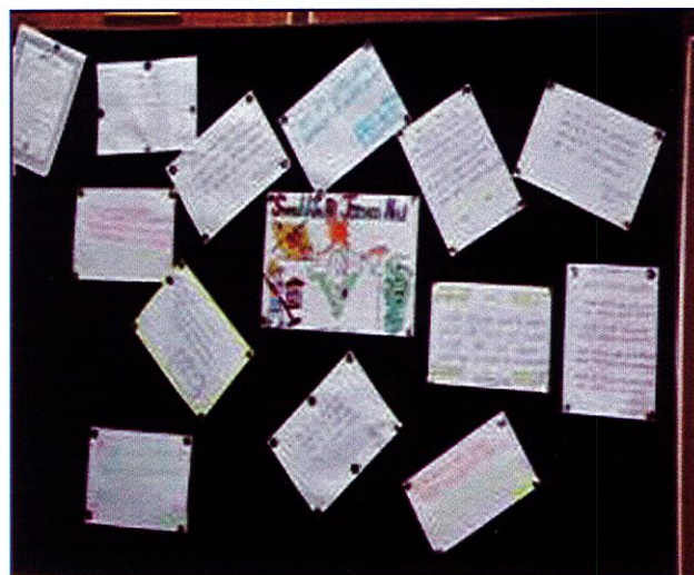
Fig. 2 Swachhta Poster and slogan entries displayed on notice board in DSIR office premises

were displayed in office premises. All officials of DSIR participated in Shramdan and an intensive cleanliness work was undertaken to weed out unwanted files and records, cleaning of workstations and office premises. DSIR officials participated in poster and slogan competition on Swachhta. Poster and slogans entries were displayed on notice board in office premises