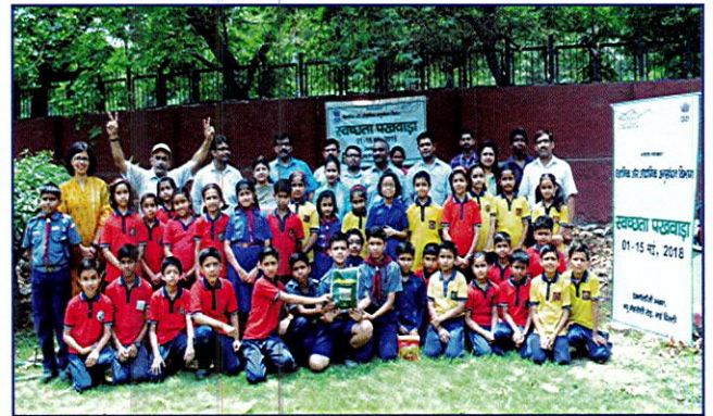
Fig. 5 School children participating in waste to wealth Awareness campaign

(III) Seminars were organized during “Swachhta Pakhwada Concluding ceremony”, where Scientists shared novel processes and green technologies to achieve the goals of waste management and better environment.