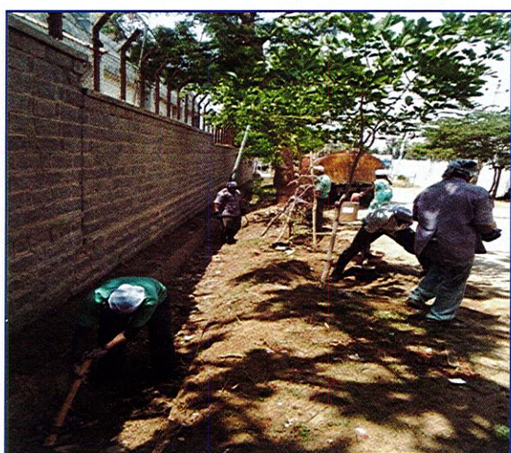
Fig. 8 (a)

(vi) DSIR stakeholders were engaged to observe 'Swachhta Pakhwada' fortnight from 1-15 th May 2018. Call for participation was displayed on DSIR website. Many DSIR recognized R&D units of Industry and SIRO observed Swachhta Pakhwada fortnight by organizing Swachhta workshops & seminars, tree plantation drives and cleanliness drives in office and neighboring areas. They also conducted interactive awareness campaigns on personal hygiene and cleanliness in neighboring localities, villages and Schools.