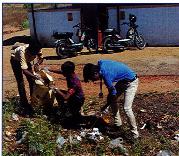
Fig. 8 (b)