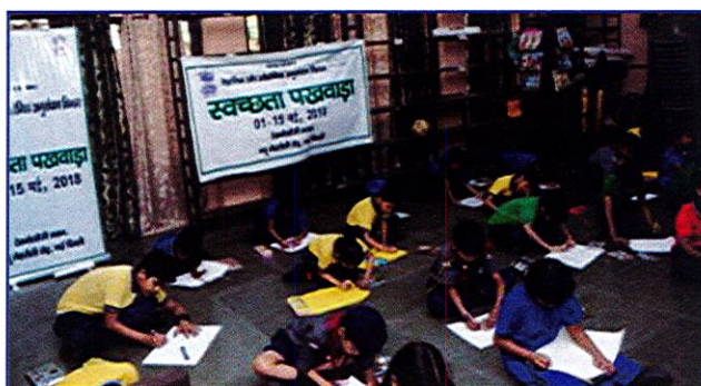
Fig. 7 School students participating in poster competition on Swachhta Theme

(vi) DSIR stakeholders were engaged to observe 'Swachhta Pakhwada' fortnight from 1-15 th May 2018. Call for participation was displayed on DSIR website. Many DSIR recognized R&D units of Industry and SIRO observed Swachhta Pakhwada fortnight by organizing Swachhta workshops & seminars, tree plantation drives and cleanliness drives in office and neighboring areas. They also conducted interactive awareness campaigns on personal hygiene and cleanliness in neighboring localities, villages and Schools.