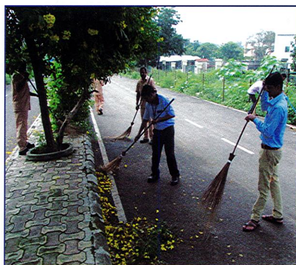
Fig. 8 (d)