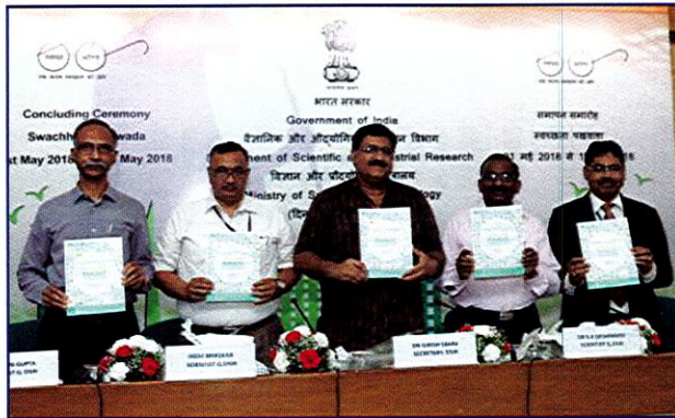
Fig. 3 Secretary, DSIR releasing Swachhta Compendium during Concluding Ceremony of Swachhta Pakhwada fortnight