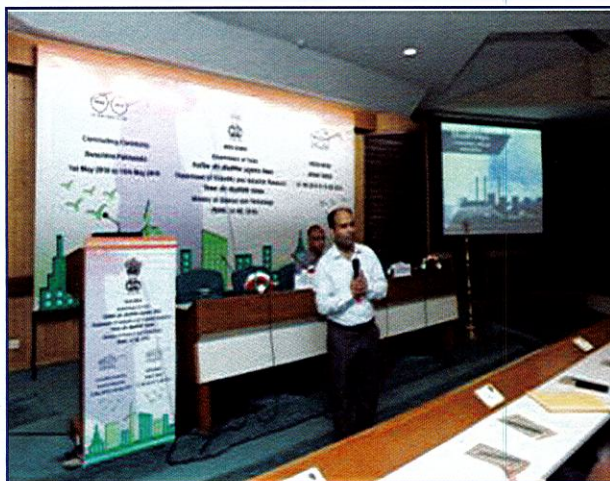
Fig. 4 A participant delivering a lecture during technical session during “Swachhta Pakhwada Concluding ceremony”

(III) Seminars were organized during “Swachhta Pakhwada Concluding ceremony”, where Scientists shared novel processes and green technologies to achieve the goals of waste management and better environment.