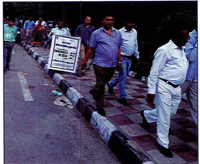
Fig. 10 DSIR Officer's & Staff Members participating in the Swachhta Hi Seva rally