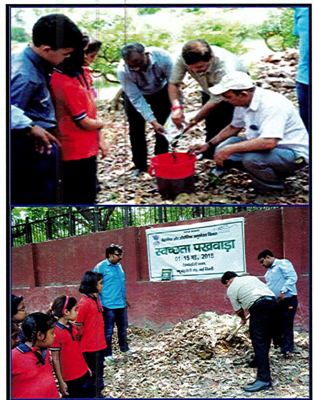
Fig. 6 Demonstration of Bio-composting to school Children during Swachhta Pakhwada fortnight

(IV) Waste to wealth Awareness campaign: DSIR officials worked with a team of experts to demonstrate bio-composting to school children and its role in improving the quality of garden soil. A mini bio-composting plant was established on the premises of Kendriya Vidhalaya, NCERT with the help of M/s Excel Crop Care Ltd., New Delhi.