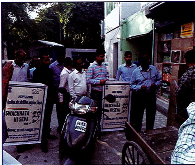
Fig. 9 DSIR official and staff interacting with locals and spreading message of Swachhta Hi Seva