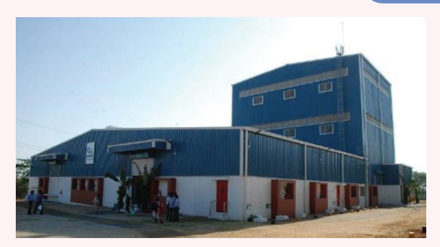
Side view of Palletization plant at NRPL site