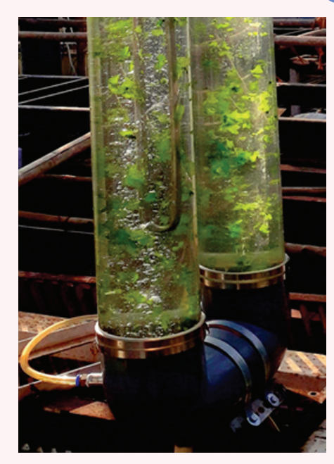
Air-lift Tubular PBRs with low power efficient sparging system