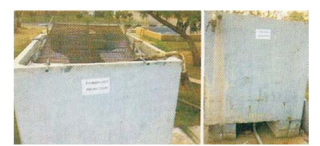
Fig 5: Pilot Plant (Bio-reactor)

Shri Arunav Misra from Vadodara has developed a bioreactor to treat medical waste (fig 5). The worm composting is an alternative option which is safe and environmental friendly technology to treat medical waste economically by using a bioreactor. The novel bioreactor is based on aerobic system of biodegradation in a closed container duly incorporating oxygen transfer, pH, moisture and temperature controlling arrangements. Organic medical waste is loaded from top and compost is released from bottom end. Worm and other microorganism are populated inside the vessel providing food and useful supports. The mechanism helps in faster processing that has a compound effect on the levels of pathogens namely E.coli, Faecal Coliforms and Salmonella sp. with more than 99.9 per cent possible reductions. Worm composted material exhibits greater pathogen reduction than achieved with conventional composting.