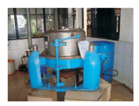
Fig 2: Centrifuge System

Development of small PV-Wind hybrid power plant for rural application by M/s Rajasthan Electronics and Instruments Ltd., Jaipur (REIL)