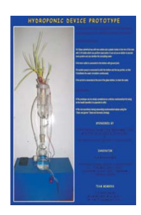
Fig 11: Hydroponic Device Prototype

can serve as a Neutraceuticals kit, which would be an ideal kitchen commodity, easy to operate and maintain.