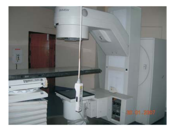
Fig. 4: Radiotherapy Simulator for Radiation Cancer Treatment

Radiotherapy (Radiation treatment) plays a major role in multidisciplinary cancer treatment. Delivering accurate radiation dose conforming to the tumour is one of the most important needs in Radiotherapy. To achieve this radiation conformal treatment for all types of cancer, Radiotherapy Simulator (RTS) is the basic hardware equipment. RTS is basically a Radiological Imaging System, mimicking all the mechanical functions of a Teletherapy treatment machine (telecobalt Machine or Linear Accelerator), which is used for radiation treatment of cancer. With Radiotherapy Simulator it is possible to create all types of image reconstruction, storage, networking and result output.