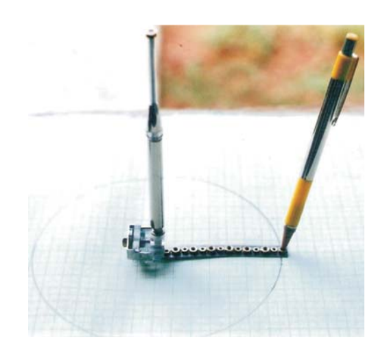
Fig 8: Geometric Instrument

Plotter bodies. In the conventional practice with the existing geometrical instruments, it is essential to measure each activity separately by using the scale or protractor, prior to drawing the lines circles, arcs, and angles etc. Instead, by not doing any measuring activity the same may be drawn for the major measurements, directly through the small plotter holes, those are provided in the body of the instrument itself with suitable size, shape, location, degrees and with complete foolproof mechanism (fig 8).