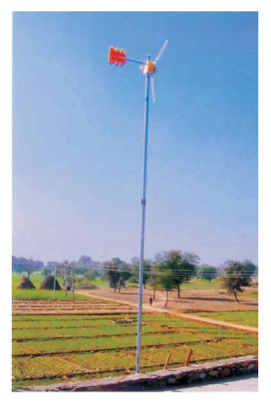
Fig. 3: Small PV-Wind Hybrid Power Plant for Rural Application