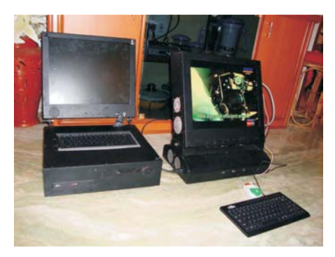
Fig 12: Cabinet of Personal Computer

Ms. T. Bhargavi from Chittoor, Andhra Pradesh is working on the project titled cabinet of Personal Computer (fig 12). This PC cabinet is a single unit instead of two separate units as in the existing system, viz. CPU and Monitor. The innovator got this idea while cleaning the house. The existing system has too many cables which restrict the cleaning and it may damage/disturb the system also. The proposed cabinet is having the base at bottom in which Hard disk and CD ROM/DVD writer is positioned. On this base, moveable cabinet is positioned containing the LCD screen in front side and mother board, switch mode power supply system at the back. This cabinet is fitted with the pivot mechanism at the base. The key board is designed to protect the LCD/TFT Screen from damage when it is not used.