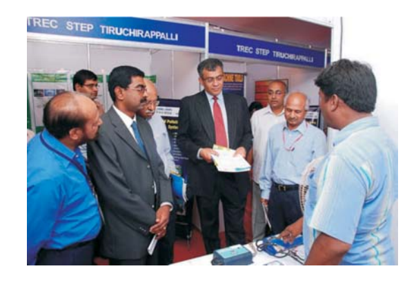
Fig 14: A view of TePP Exhibition at Coimbatore

The purposes of these activities were to disseminate information on TePP to the larger mass of the populace.