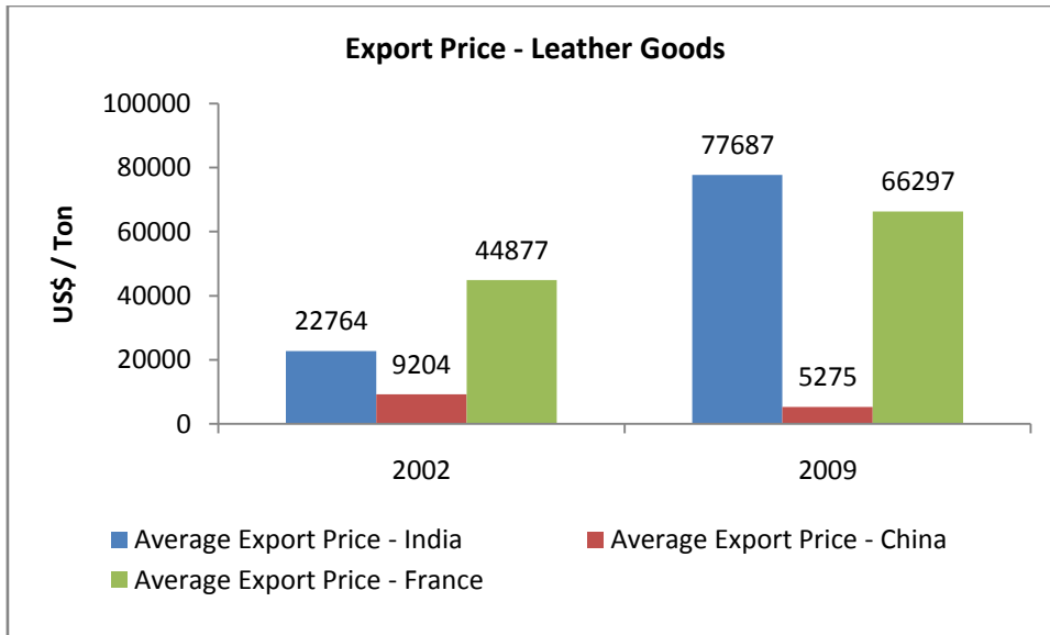
Source: ITC, D&B Calculations (Export Price for the sector has been arrived at by averaging the export price of individual product segments)