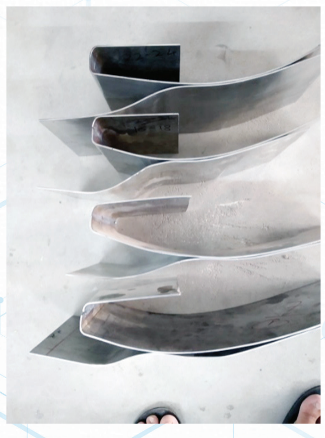
Mylimb Prosthetic Leg

Prosthetic socket - the prosthetic socket support the patient's body weight and hold the residual limb firmly and comfortably during all activities. The prosthetic socket is made of HDPE plastic that is lighter and takes to the shape of patient's foot. It provides protection, cushioning, conform to volume change of residual limb and confidence; Pilon - Aircraft grade aluminium (6061-T6) has been used, which is structurally stronger and lighter than steel; Feet - Prosthetic feet is made up of carbon fiber that meet the functional needs for shock absorption and energy storing response, and are light weight as well, strong, as it take on huge force and torque as patient wants to walk and run.