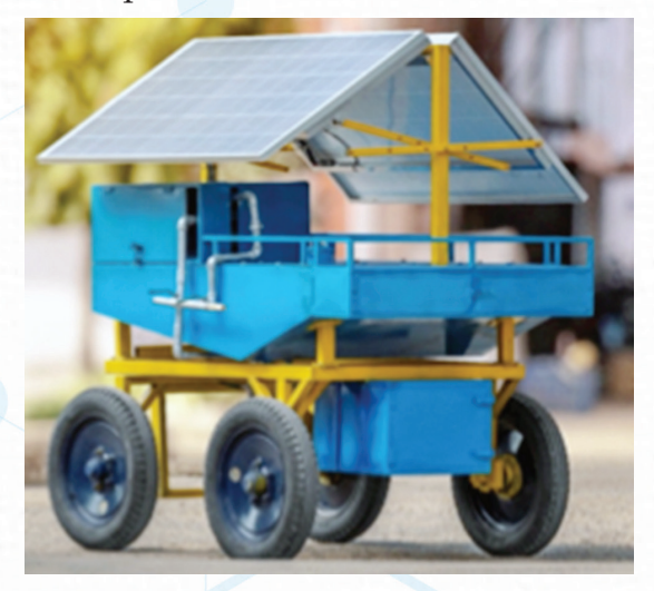
Solar operated micro irrigation applicator with drip irrigation system

The innovation will bring revolution in production and productivity in dry land agriculture. The profitability of farmers and GDP of country will increase appreciably. The innovative machine will encourage farmers to adopt high value crops to generate more income. The machine is capable to save crop, when it is under severe moisture stress conditions. The innovation will help those land holdings in remote area where there is no electricity or diesel engines or gensets etc. The solar operated micro irrigation applicator is useful for other purposes e.g. lighting, music system, mobile charging, drinking and bathing of animals etc. The rain water harvesting mechanism is inbuilt system with the machine to store water in storage tank for irrigation. This will avoid dependency of water from other sources. The innovation helps towards Per drop More Crop through drip irrigation technology. The innovation will contribute towards doubling of income of the farmers as per the agenda of the government. The project has successfully been completed