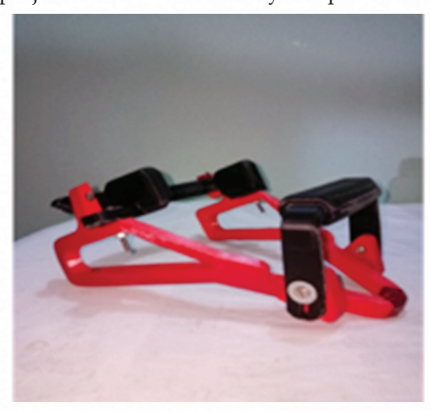
Effective & Preventive prosthesis for treatment of multiple neck ailments

support for providing support for different spinal pathology like cervical spine fracture and delivery of certain modes of pain alleviation like UST and IFT therapy. The project has been successfully completed.