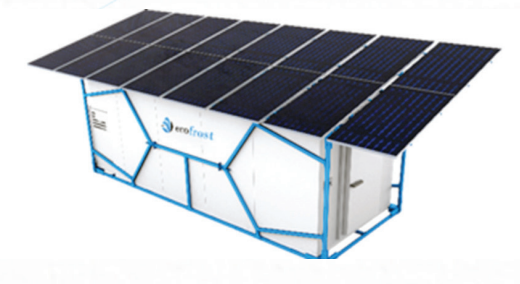
Solar Powered Farm level cold storage with battery-less refrigeration and thermal storage: A standalone rural Innovation for inclusive growth

biomass. The proposal envisages like development & deployment of 8 pilots for testing product performance over different climatic conditions and geographies. This unit uses PV powered Vapor Compressor Cycle along with thermal storage system and hybridization, which produces required cooling effect and run 24x7 hrs. with an energy storage system. Micro Cold Storage is small-scale solar powered cold storage system. It is a pioneering product in the cold chain space that bundles various innovations together. The system contains both precooling and storage arrangement. It comes with every feature of an ideal cold storage system and is complete standalone. It can be hybridized with any other source of energy as the need be. The end product has been endogenously developed cold storage system for Commodities like Fruits, Vegetables, Flowers, Seeds, Grains with approximately 3.5 metric ton of storage capacity with an in-built pre-cooling capacity of 0.5 metric tonnes. The product (Cold storages) near / at the farm location will minimize postharvest losses by ensuring that the product quality and quantity doesn't deteriorate till it reaches the customer. The innovation has got many awards. The project has successfully been completed.