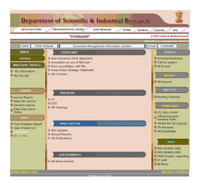
Department of Scientific & Industrial Research ORGANISATIONAL CHART POST MESSAGE HOME SEARCH LOGOFF "EXTRADSIR" PAMS DSIR Website Document Management Information System Email CPGRAMS Welcome to this EXTRA-NET of DSIR Seminar/Workshop This application provides a medium to work between the TECHNOLOGY bhawan and your establishment. This has the following main features. All Events I) Users can send and receive instant messages (to and fro DSIR) through INBOX and OUTBOX. NEWS Users can also access here the Document Management Information Syste for effective file transactions. RDI AWARD 2006 PRDI AWARD 2005 TePP Project regarding IT LAW Any Other Suggections to improve EXTRANET are always welcomed. THANK YOU